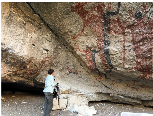
Figure 1 – M. Díaz-Andreu during IR measurements in Cueva Pintata

The Rock Paintings of Sierra de San Francisco encompass an area of almost 1900 km 2 in El Vizcaino natural reserve in the northern part of Baja California Sur (Mexico). It includes more than 400 rock art sites where Outstanding Universal Value has been recognized by UNESCO in 1993 ( https://whc.unesco.org/en/list/714/ ). Sites are composed by rock shelters and small caves mainly located along river canyons. Paintings and engravings are remarkably well-preserved because of the dry climate, the inaccessibility of sites and the low population density of the region. The most significant rock art tradition of this area is the so-called Great Mural style (fig.1), which is known since the end of the XIX century (15). The Great Mural rock art composition and size, as well as the precision of the outlines and the variety of colors, make this artistic tradition impressive. The Great